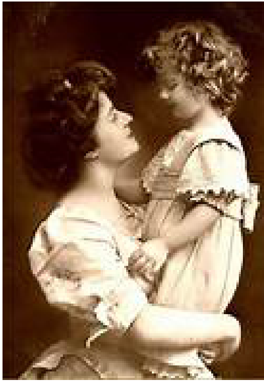
The wicked hate to see White Christian mothers having babies. And if they do, then the wicked want to sexually mutilate them with "trans gender" surgery.

first he had to get home. Just knowing he was in a horrible situation wasn't enough. Just realizing he was better off when he was with his father, wasn't enough. Just wanting to go home wasn't enough - he had to actually go home. Just because million of Christians know American is swirling down the